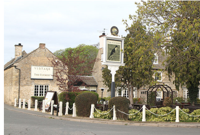
Church Street, Alwalton